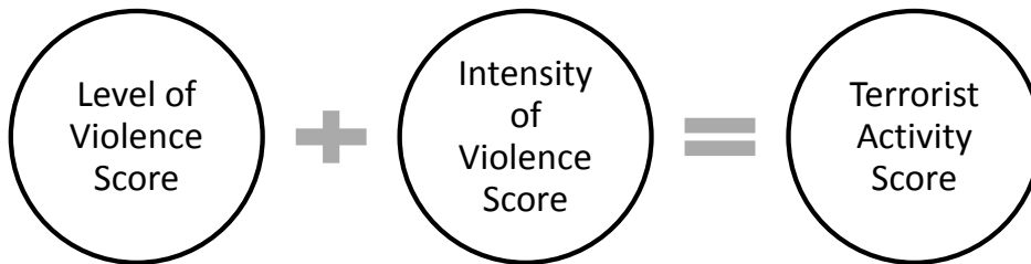
Figure 2 Measure of Terrorist Activity

As shown in Figure 1, the more violent and the more intense the activities, the higher the score of the terrorist.